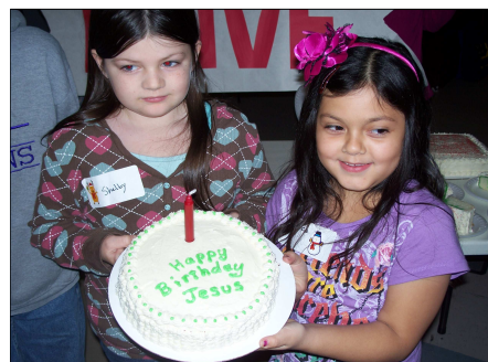
Sonshine Express Christmas Party!