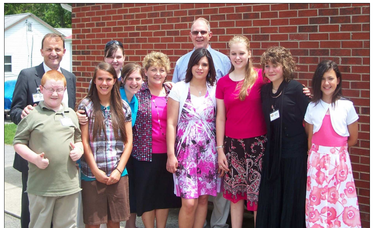
CEF of MARCK Christian Youth In Action 2011

Statistics! 85% of all who accept Christ do so between the ages of four and fourteen, when they are children! Reaching children for Christ is spiritually a highly productive ministry. Recently CEF workers in the USA and around the world have shared the Gospel to over 10 million children in just one year! You can be a part of this! Now is a good time to let us know if you are interested in seeing children come to Christ in 2012!