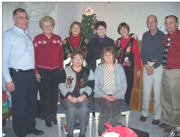
CEF of MARCK Local Committee