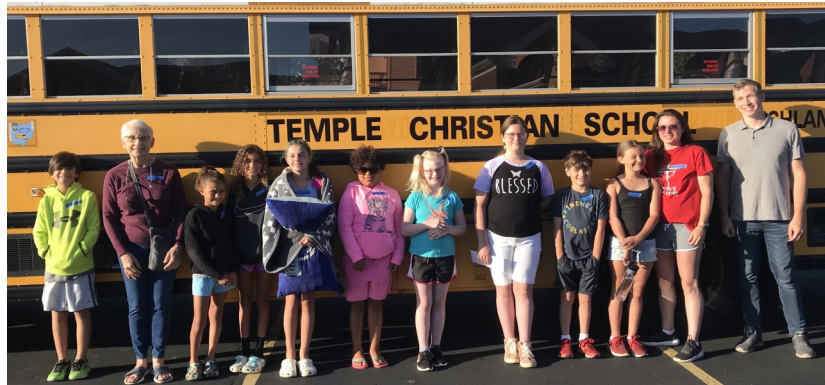
Pictured to the left are a portion of the 17 children who had grant scholarships to attend Joy of Living camp for a week at the end of June. Our CEF Chapter facilitated a 5-Day Club each evening of the camp. Some fun and encouraging camp highlights shared by kids and parents are on Page 4.