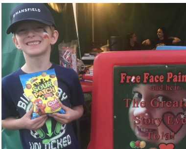
This young man won the daily drawing at the Wordless Book Tent