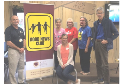
Quick Start Training at Journey Church

In November we are planning to conduct another Quick Start GNC Training at Centerburg Free Will Baptist Church to prepare them for starting another club at the Centerburg Elementary School. Pray that the Lord will open all the doors to make this possible with the 10 volunteers ready to help!