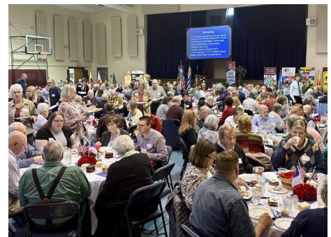
God blessed us with our largest banquet ever with approximately 250 people attending

As a result of the annual fundraising banquet, the Lord blessed with $43,000 to further the ministry of CEF of MARCK, reaching more children with the Gospel of the Lord Jesus Christ!