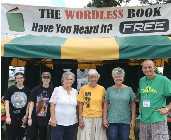
Workers at the Crawford Co. Fair

The Lord has really blessed the summer fair ministry this year. We purposefully prayed for God to provide a fair coordinator for each fair. This person was asked to find volunteers to just register the children hopefully with church partnerships. We had three church partnerships (Crestline Church of the Nazarene, Bucyrus First Alliance Church and Wayside Chapel) for Crawford County